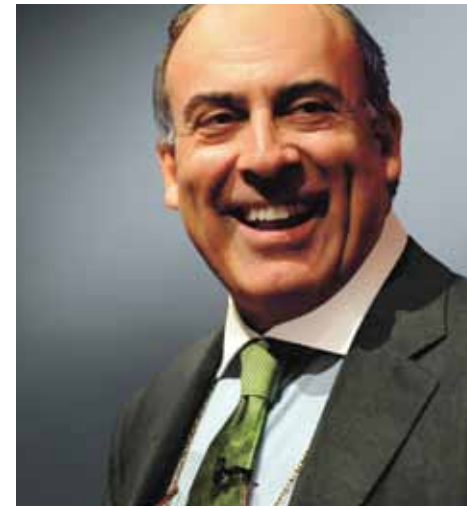
Muhtar Kent Chairman and Chief Executive Officer

The Coca-Cola Company's third U.S. Diversity Stewardship Report includes details on encouraging progress, effective action and clear commitments. It is also the first to include Coca-Cola Refreshments, our largest bottling operation in North America.